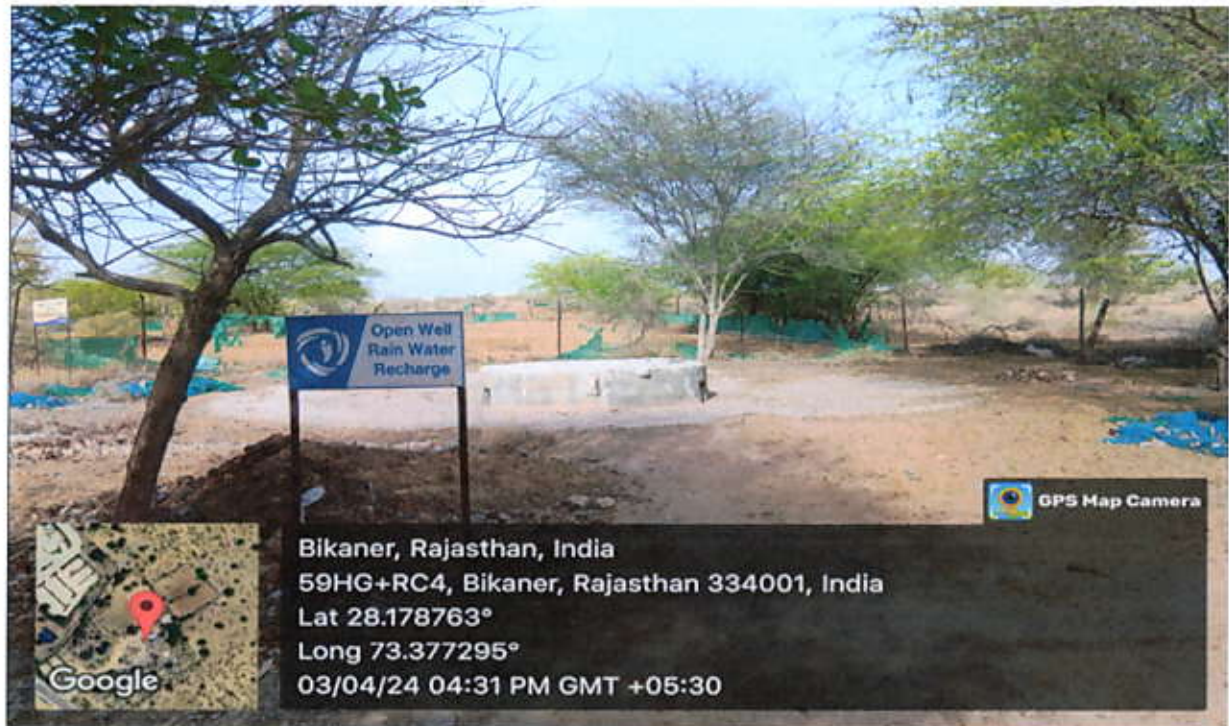
Open Well Rain Water Recharge